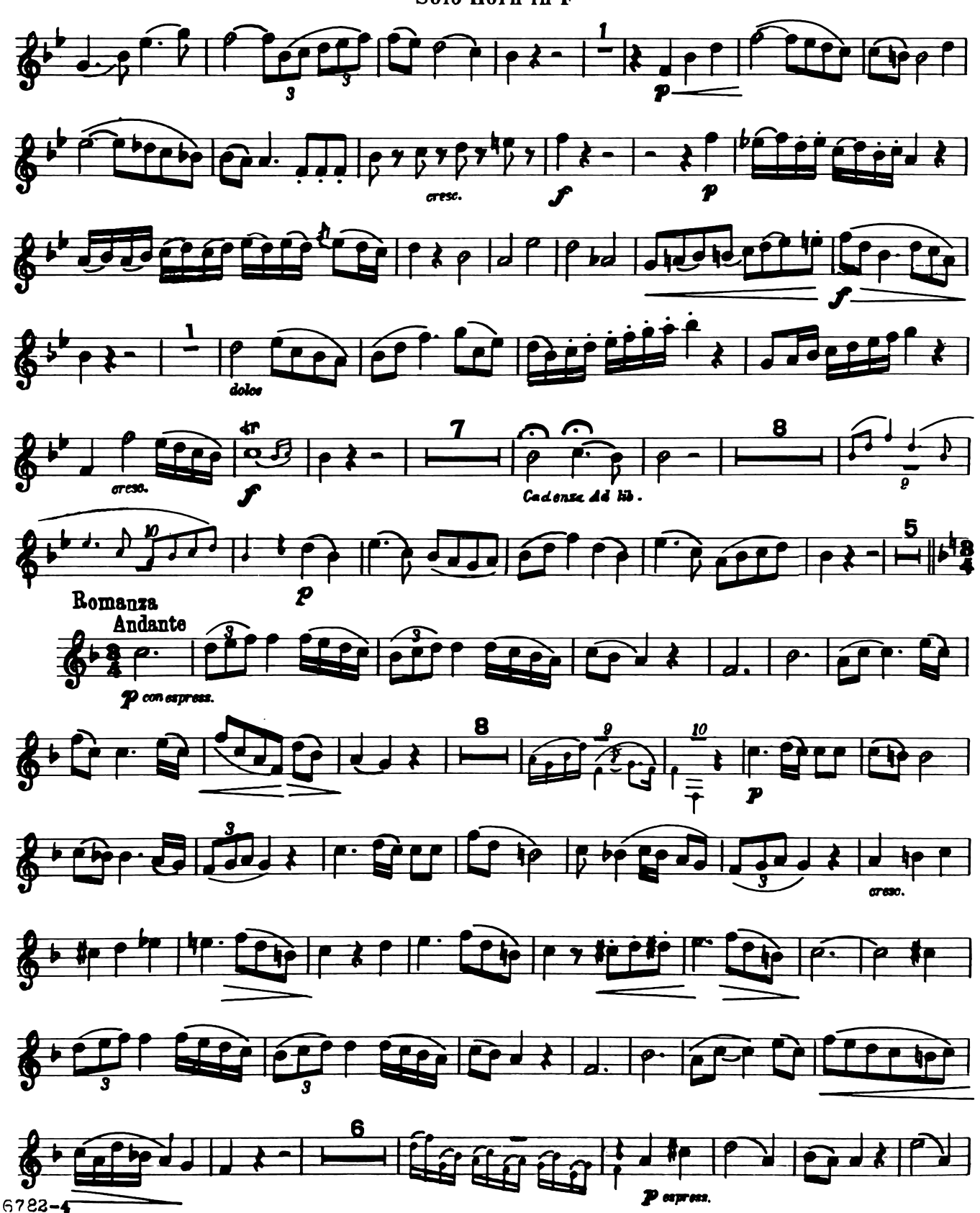
Solo Horn in F