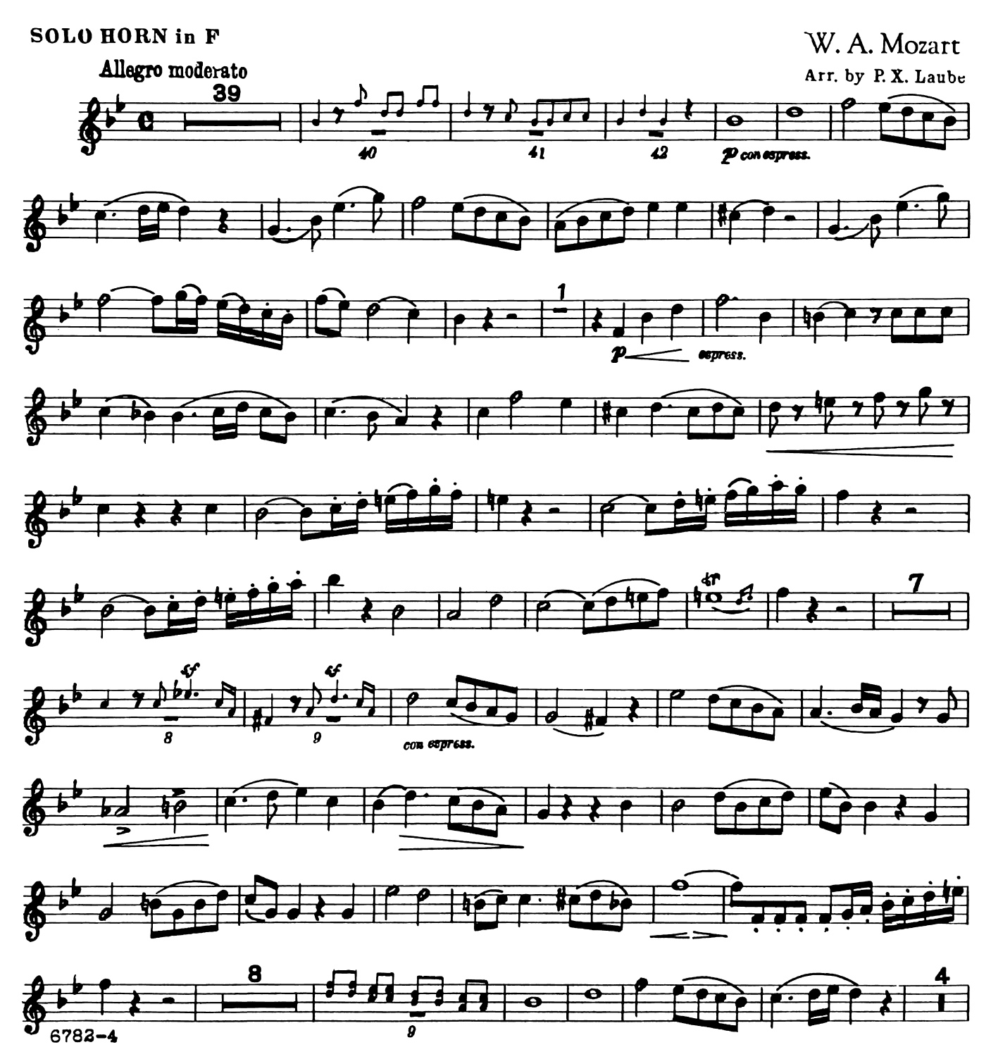
The Cundy-Bettoney Co., Inc. Boston, Massachusetts